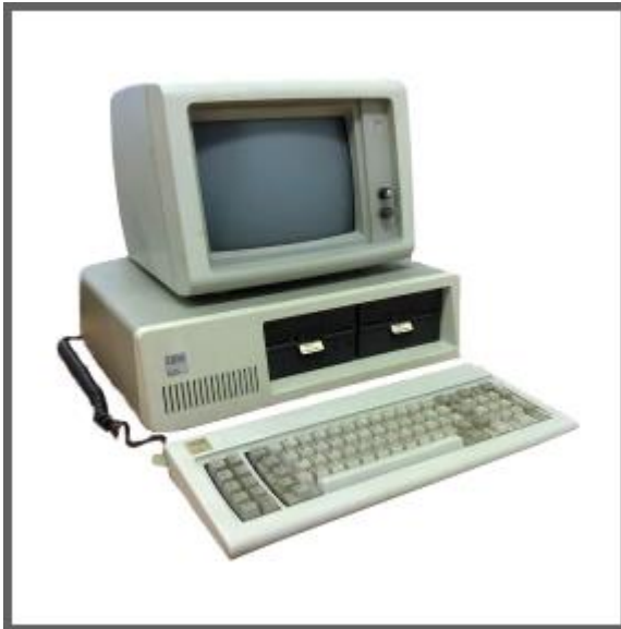
IBM 5150 – First IBM PC – 1981

From a computing standpoint, it had everything a small computer could have for its time. By introducing the 5150 (the "IBM PC" as it was called), IBM literally invented the category of PCs in the public mind.