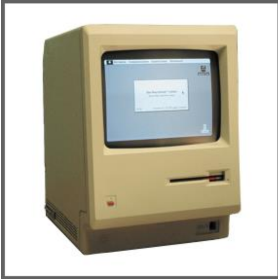
Apple Macintosh – 1984

Again, the strategy of creating a new Category Class that fulfilled consumers' ASPIRATIONAL desires for the product while DE-POSITIONING the market leader made it a winner, without having to compete financially against an entrenched giant.